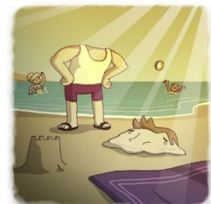
"He who has a head of wax must not walk in the sun" (Italian proverb)

"Neņem pārāk daudz siena uz savām dakšām" (holandiešu sakāmvārds)