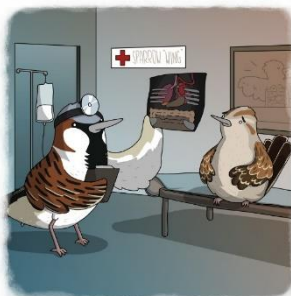
"As small as it is, the sparrow has all the right organs"

"Vilku barā dzīvojot, ir jāgaido kā vilkam" (krievu sakāmvārds)