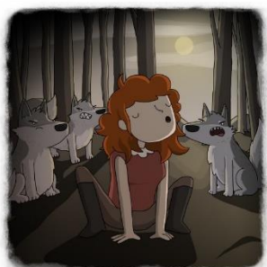
"To live with wolves, you have to howl like a wolf"

"Spilvens ir labākais padomdevējs." (zviedru sakāmvārds)