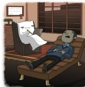
"The pillow is the best advisor."

"Neveikla balerīna vaino savu svārku vīli." (poļu sakāmvārds)