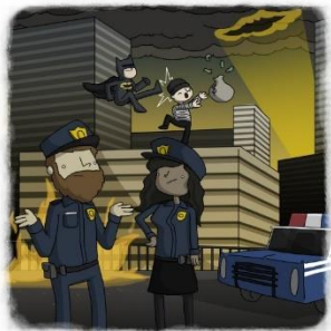
"Leave it to Batman." (Filipino proverb)

"Kad ziloņi cīnās, cieš zāle." (Kenijas sakāmvārds)