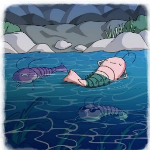
"Shrimp that fall asleep are carried away by the current"