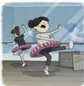
"A bad ballerina blames the hem of her skirt"

"Garneles, kas aizmigušas, aiznes straume" (Kolumbijas sakāmvārds)