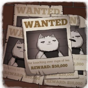
"Accusation always follows the cat." (Iraqi proverb)

"Suns, kuram iekodusi čūska, baidās no desām." (Brazīlijas sakāmvārds)