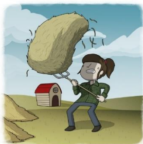
"Don't take too much hay on your pitchfork" (Dutch proverb)

"Vainīgs vienmēr ir tas, kura nav klāt." (īrakiešu sakāmvārds)