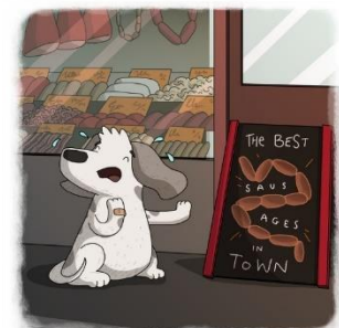
"A dog bitten by a snake is afraid of sausages" (Brazilian proverb)

"Pat tārps var dusmoties." (Sjerraleones sakāmvārds)