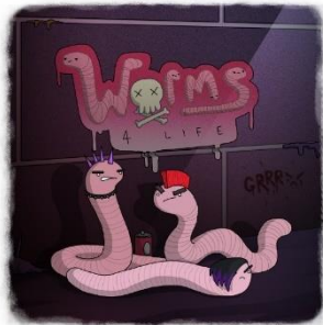
"Even a worm can get angry." (Sierra Leonean proverb)

"Atstāj to Betmenam." (filipīniešu sakāmvārds)