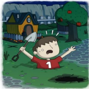
"He who digs a pit for others will fall in it himself" (Romanian proverb)

"Katrā kartupeļu maisā ir pa vienam sabojātam kartupelīm." (Velsiešu sakāmvārds)