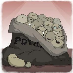
"There's a bad potato in every sack." (Welsh proverb)

(Oriģinālais materiāls - https://www.teachers-corner.co.uk/15-proverbs-from-around-the-world-to-teach-values-and-refresh-vocabulary/ )